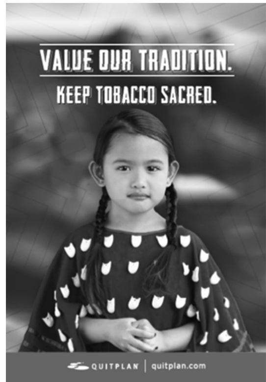
Figure 5 Minnesota example of counter-marketing strategy against tobacco industry misappropriation of American Indian tradition. 59

included. For example, we were unable to find any internal documents from SFNTC prior to 2002 (when SFNTC was acquired by RJR) because they were a small, private company and not subject to the disclosure requirements of the Master Settlement Agreement. 60 Given the scope of our research question, we excluded documents regarding the complex issues of sovereignty and tribally owned tobacco entities. These issues warrant further examination and need to be respectfully considered in light of the complex political and economic realities facing American Indian tribes. 7,61