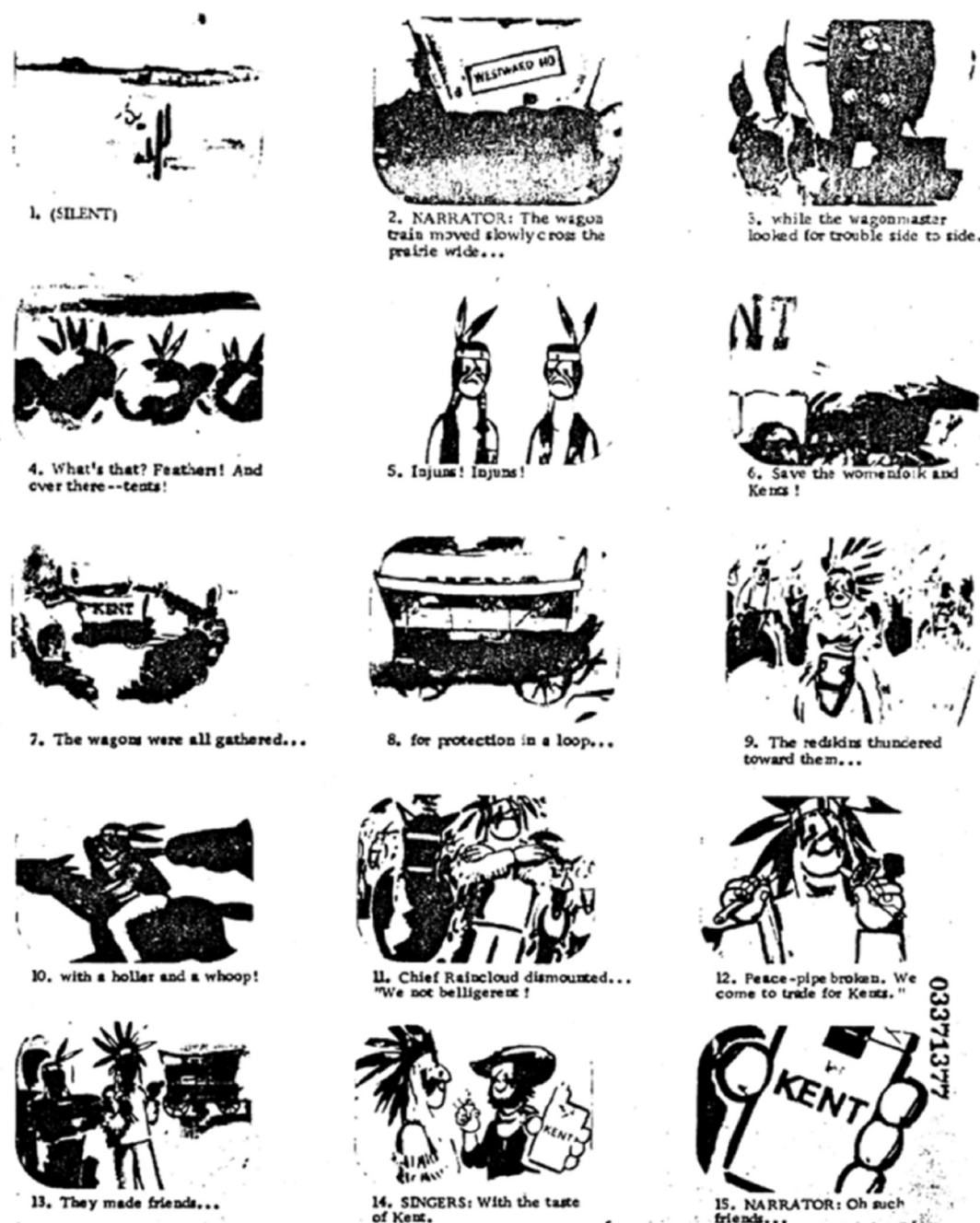
Figure 2 Script for Kent cigarettes television commercial 'Wagon Train'. 31

This continued with images portraying American Indians on packages. One 1990 B&W advertising document described a low-tar cigarette as: