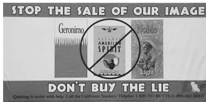
Figure 4 California example of counter-marketing strategy against tobacco industry misappropriation of American Indian tradition. 58

Our study has several limitations. Because some of the industry documents are restricted (due to confidential information) and of the sheer volume of documents, we were unable to determine whether all documents relevant to our research question were